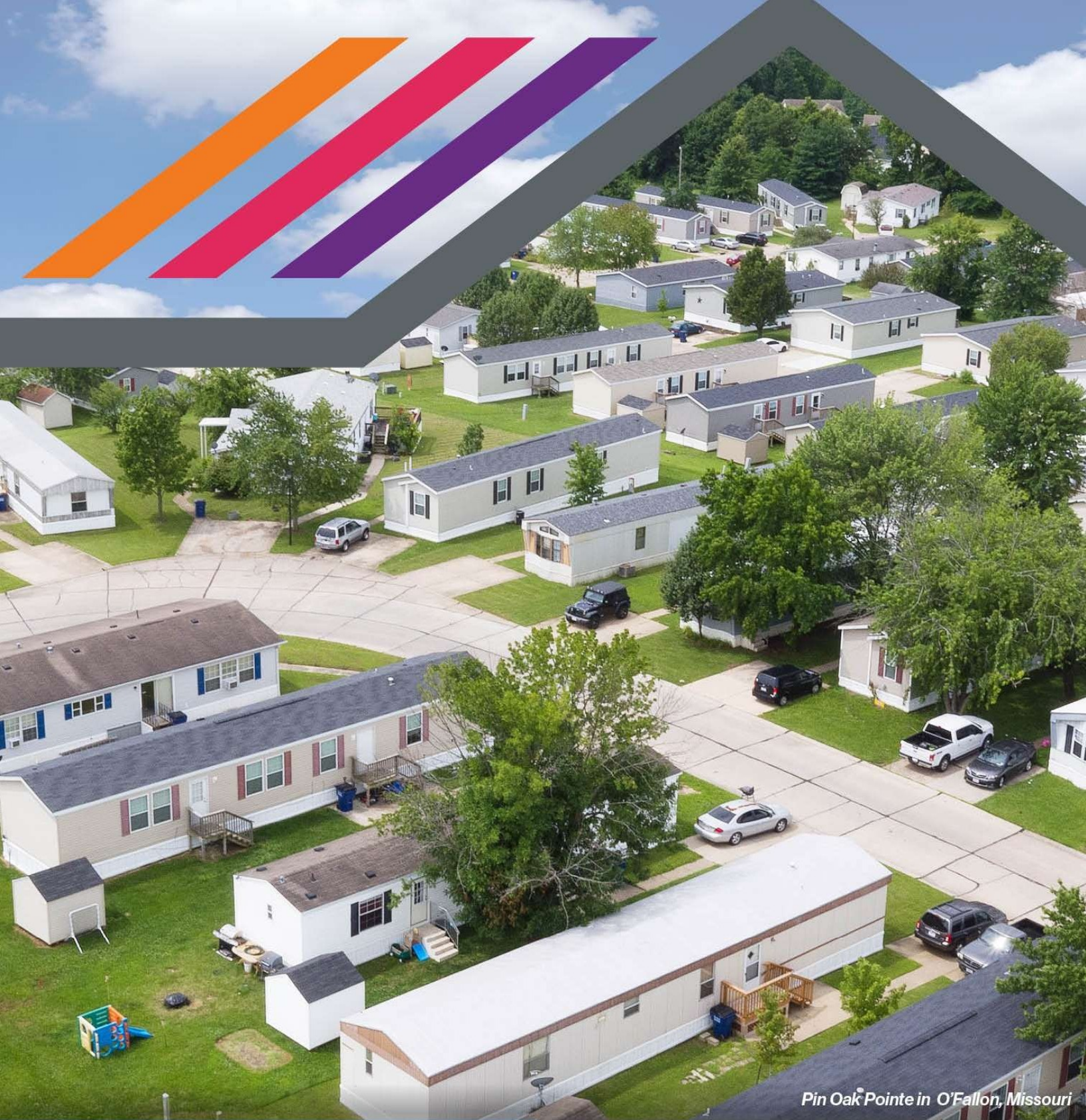
Pin Oak Pointe in O'Fallon, Missouri